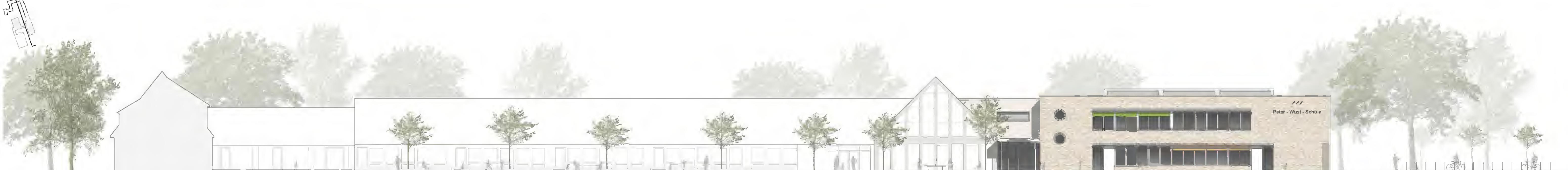
Ansicht Westen Anbau M. 1:200