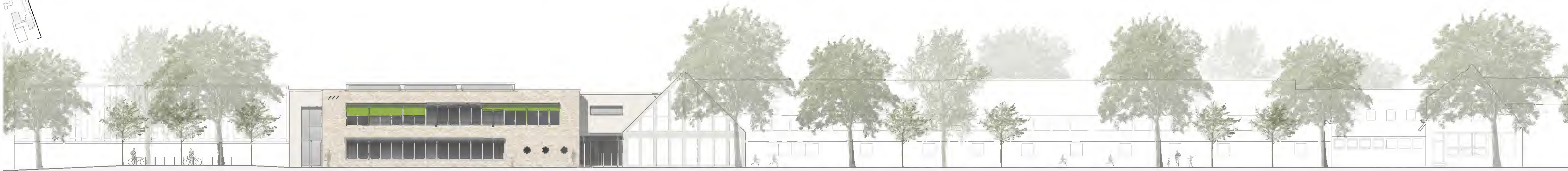
Ansicht Osten Anbau M. 1:200