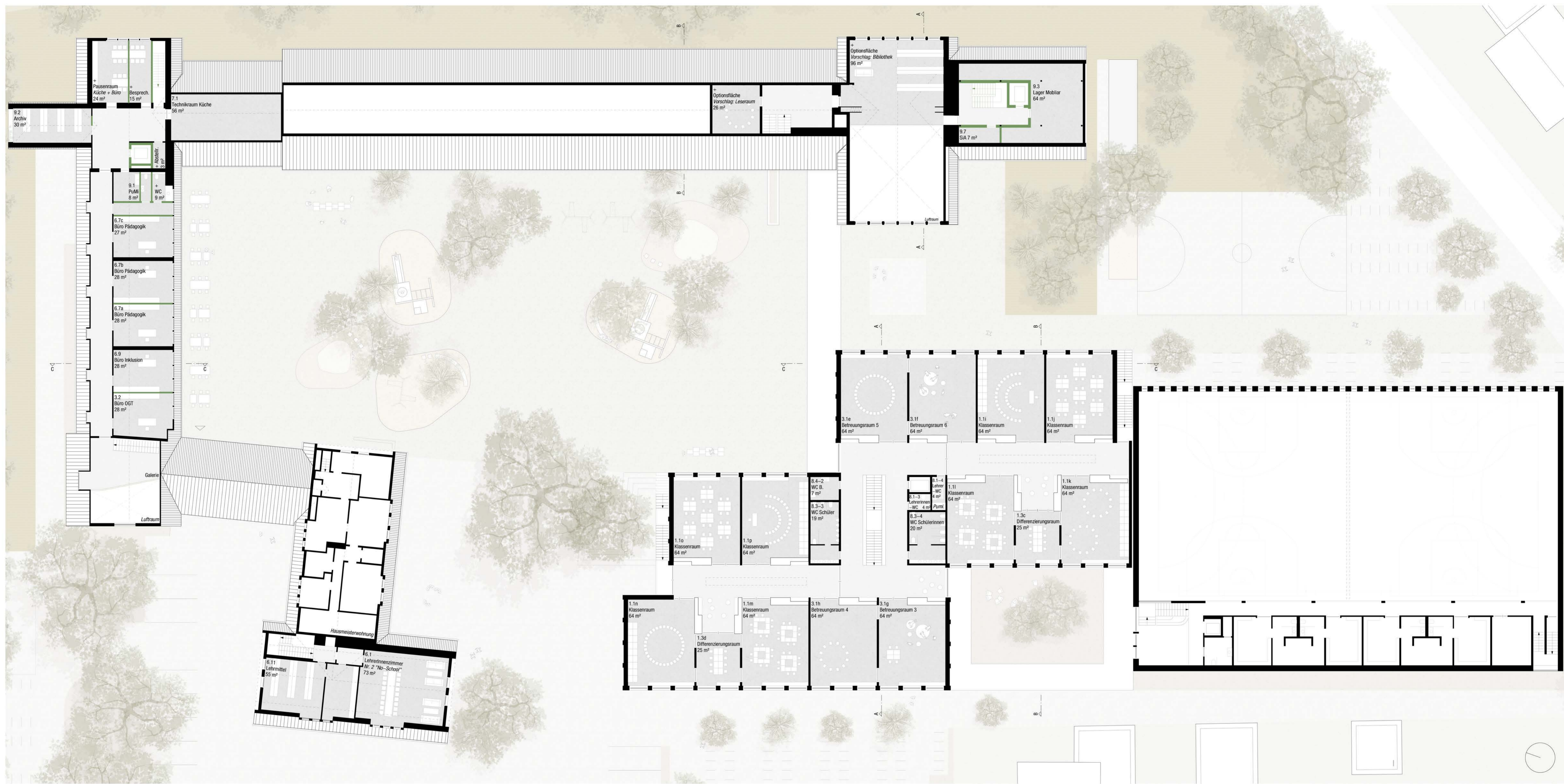
Grundriss OG M 1:200