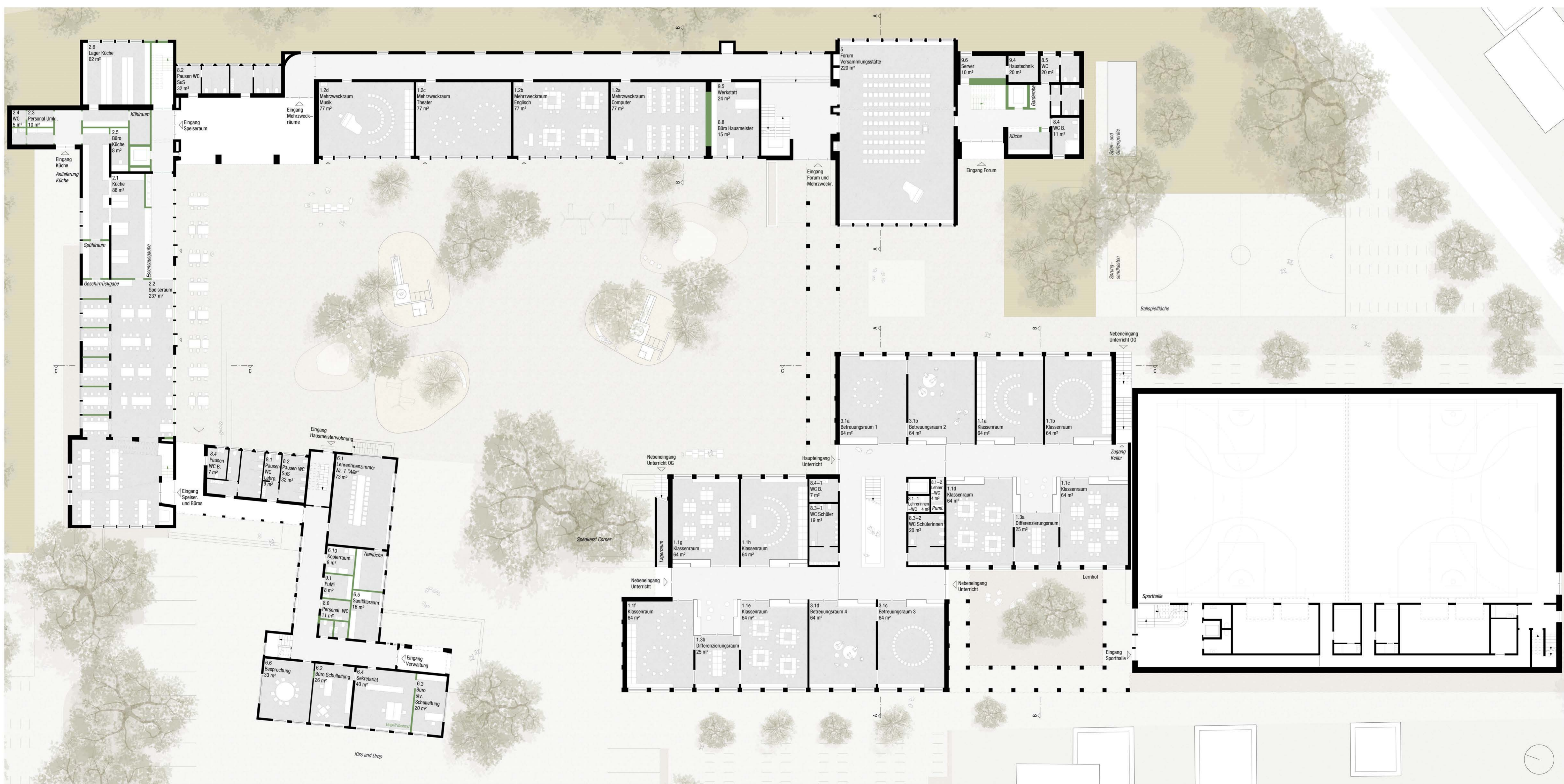
Grundriss EG M 1:200