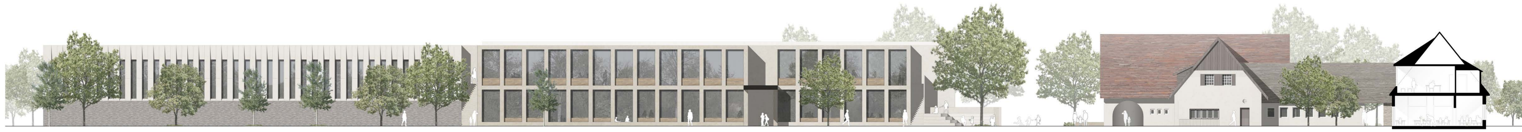
Ansicht Osten M 1:200